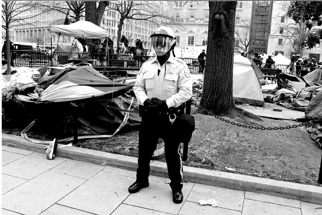
Enclosure: The National Park Service and the Eviction of Encampments in Washington DC No Copyright 2022 Set in Garamond 24 pt, 12 pt